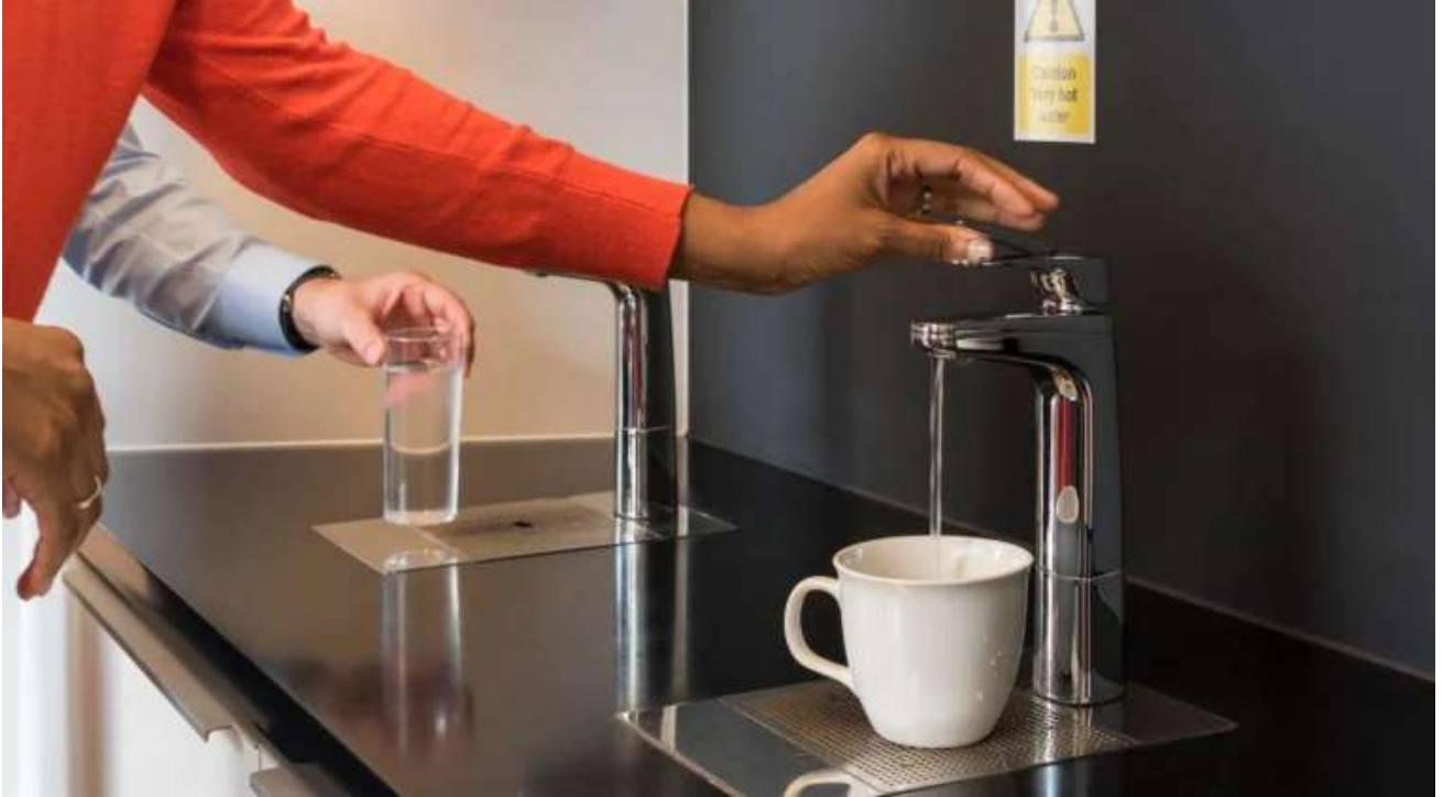
Drinking Water Systems Merquip