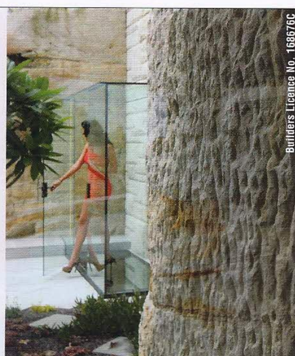
Builders Licence No. 168676C